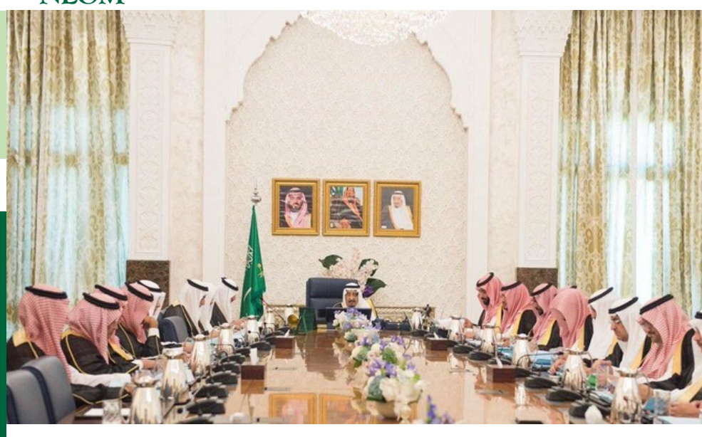
King Salman chairs the council of ministers meeting for first time in Neom,31 July 18.

Saudi Arabia would form a higher committee for hydrocarbons to be headed by Crown Prince Mohammed bin Salman. The decision was approved in a Cabinet meeting chaired by King Salman at Neom, Tabuk region. The Higher Committee for Hydrocarbon Affairs will include the energy minister as well as the ministers of trade, finance and economy. The committee will be a reference for all hydrocarbon issues and everything relating to them and a representative of the state's rights linked to them.