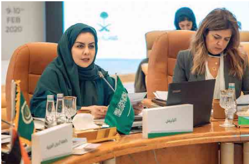
Dr. Hala bint Mazyad Al-Tuwaijri, Secretary-General of the Saudi Family Affairs Council, at the 39th session of the Arab Women Committee

The Arab Women Committee, a platform under the umbrella of the League of Arab States, has announced Riyadh as the capital of Arab women for 2020, under the slogan "Women are a homeland and an ambition."