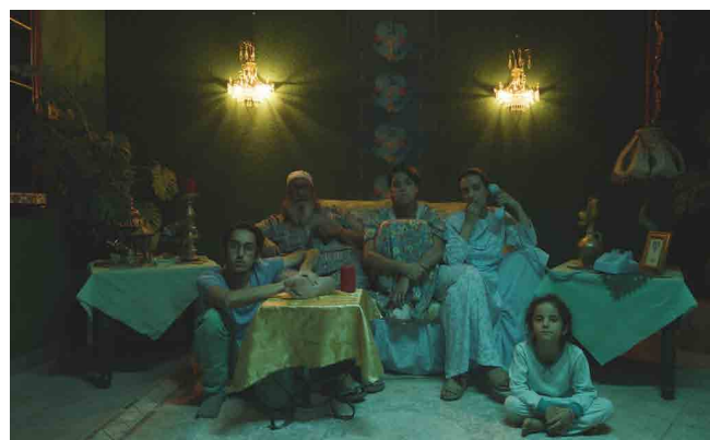
“Is Sumyati going to Hell?”, by Saudi filmmaker Meshal Aljaser (2016)

The movies shine a light on universal topics, such as social taboos, extremism, and the human psyche. Not only will “Six Windows in the Desert” offer global audiences a lens into the perspective of the Saudi creators but also through the eyes of film characters with their individual takes on storytelling.