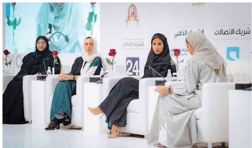
All-female panel in Saudi career fair, in Riyadh

The bank's "Women, Business and the Law" (WBL) report measures gender inequality in the law, identifies barriers to women's economic participation, and encourages reform of discriminatory laws. The report highlights improvements in Saudi Arabia's score in six of the eight indicators, notably in women's mobility, following the removal of restrictions on obtaining a passport and traveling abroad.