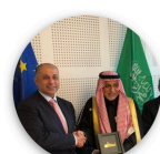
Sajjad Karim SAD