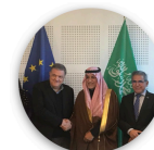
Pier Antonio Panzeri SAD