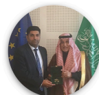
Wajid Khan SAD