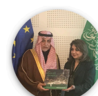
Baroness Nosheena MOBARIK CBE SAD