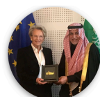
Michele Alliot-Marie CEPP

The delegation briefed the MEPs on the great role played by the Kingdom in relief and humanitarian fields in Yemen and its continued support for Syrian refugees, as well as the kingdom's efforts in supporting peace, security and stability in the Middle-East.